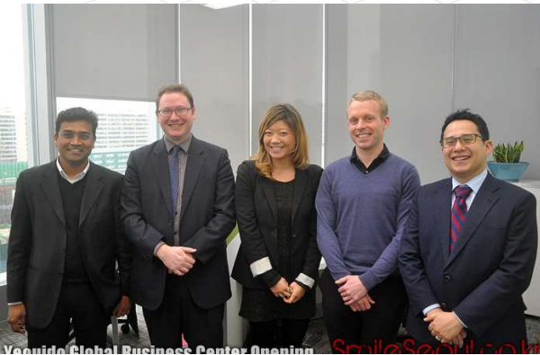
Yeouido Global Business Center Opening