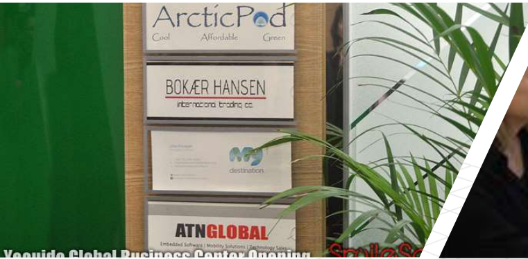
Yeouido Global Business Center Opening